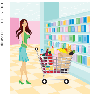
doing the food shopping