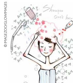
taking a shower