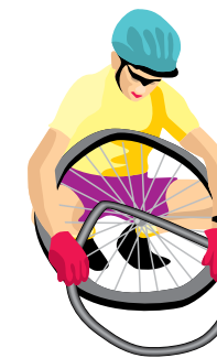
fixing my bike