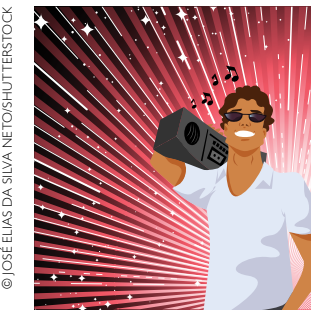
listening to music