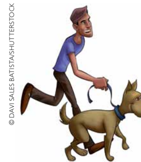
walking the dog