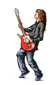
playing the guitar